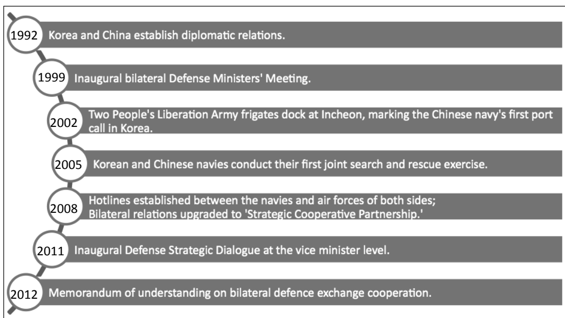
Figure 3: Development of defence relations between Korea and China