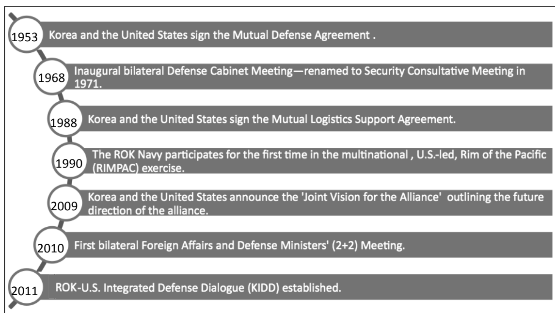
Figure 2: Development of defence diplomacy between Korea and the United States