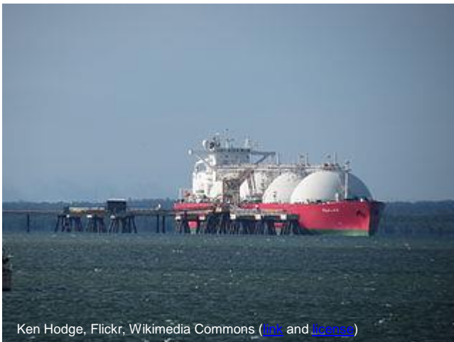
Ken Hodge, Flickr, Wikimedia Commons ( link and license )