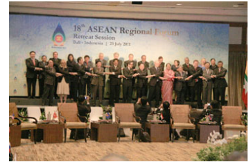
Delegates at the 18th ASEAN Regional Forum