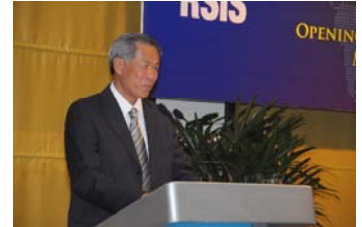
Keynote address by Singapore's Defense Minister Dr. Ng Eng Hen

This year, a total of 58 officers from 28 countries representing Asia, Oceania, North America, Europe and Africa took part. Guest speakers who attended the programme include Indonesia's Defence Minister Purnomo Yusgiantoro, Ambassador Christopher R. Hill, Professor Sir Steve Smith and others. Besides the talks, the participants were treated to a variety of visits to places of interests in Singapore including the Changi Naval Base, SAFTI Military Institute and the Night Safari. Overseas officers were also invited to attend the National Day Parade on 9 August.