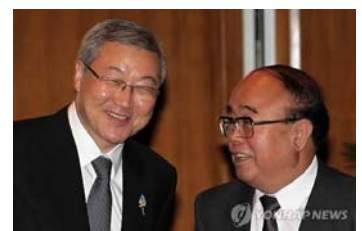
South Korean Foreign Minister Kim Sung-hwan (L) talks to his North Korean counterpart, Pak Ui-chun, in Bali, Indonesia, on 23 July

The ARF has become the primary forum for security dialogue in the Asia Pacific. The next meeting will be held in Cambodia in 2012.