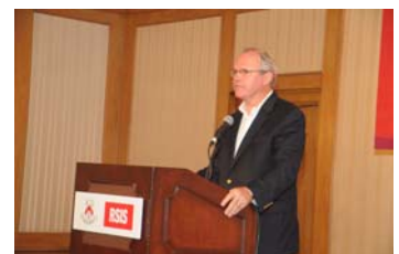
Ambassador Christopher R. Hill giving a speech at a distinguished dinner lecture

Multilateral [forums] are important tools of diplomacy...they can be used to help resolve land or sea disputes without resorting to bilateral channels where often emotions can run higher — Christopher R. Hill