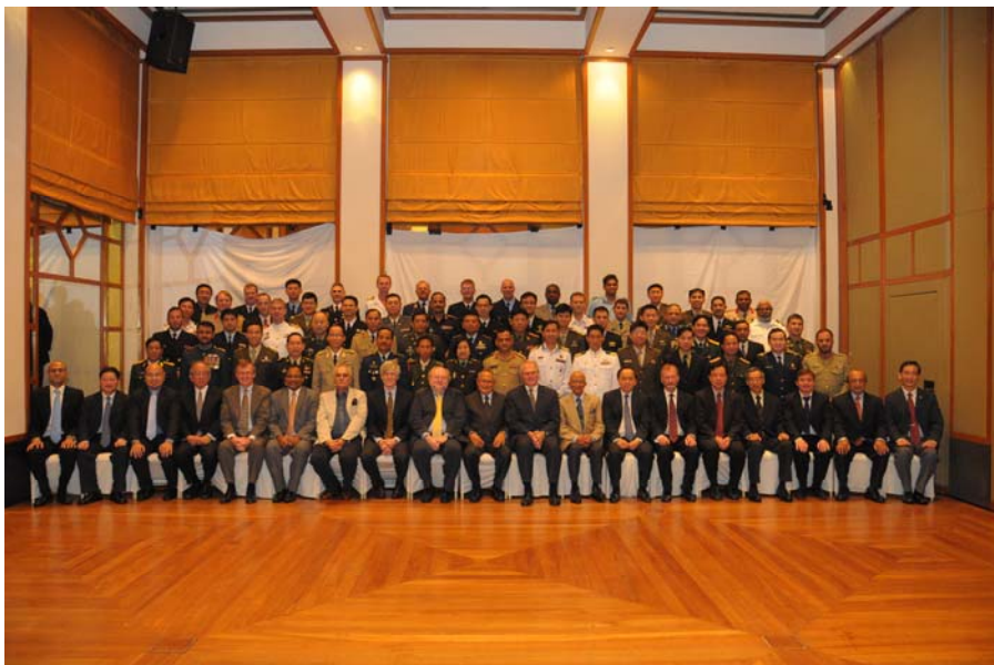
Participants at the 13th APPSMO

No one is expecting anything to happen overnight but it shows you the importance of this ASEAN setting and what we mean by ASEAN centrality — K. Shanmugam