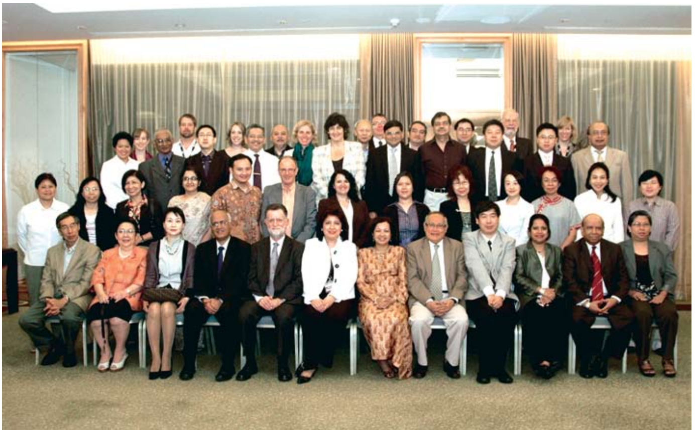
Participants of the Fourth Annual Convention of the Consortium of NTS-Asia