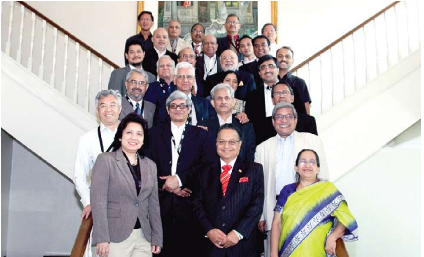
Participants at the workshop

T he Centre for Non-Traditional Security (NTS) Studies, RSIS, in collaboration with the Strategic Foresight Group (SFG), organised a workshop on “Benefits of Cooperation in the Himalayan River Basin Countries of Bangladesh, China, India and Nepal”, which was held on 2–3 December 2010. The Centre for NTS Studies co-hosted the workshop, which was aimed at building confidence and cooperation between countries that make up the central and eastern Himalayan river basins.