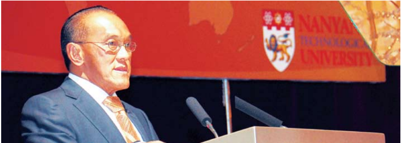
Mr Aburizal Bakrie

M r. Aburizal Bakrie, Chairman of the Golkar Party in Indonesia, appointed executive director of the Joint Secretariat of the Political Parties in the Government Coalition, and prominent businessman, was in Singapore to deliver a Distinguished Public Lecture on 18 November 2010. In this lecture “The World in Indonesia, Indonesia in the World” at the Shangri-la Hotel, he shared his view on the state of contemporary Indonesia its prospects and challenges, and its role in the world.