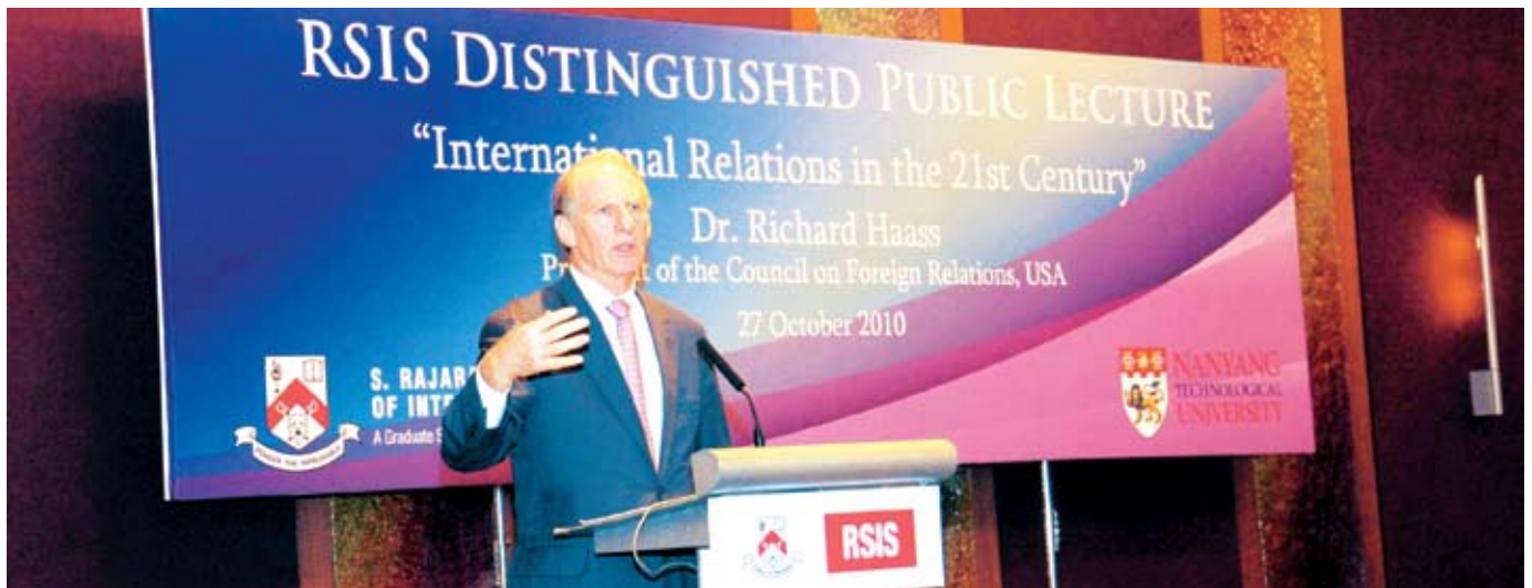
Dr. Richard Haass

O n 27 October 2010, Dr. Richard Haass, President of the Council of Foreign Relations, U.S.A., spoke on some of the major trends in world politics in a RSIS Distinguished Public Lecture titled “International Relations in the 21st Century”. The trends he identified included a non-polar world, the relative economic decline of the Organisation for Economic Cooperation and Development (OECD), a gap between the array of global challenges and threats, the state of existing global institutions, the persistent instability of the greater Middle East, and the dynamism of Asia.