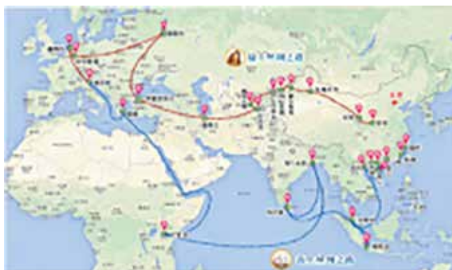
Image 1 OBOR Map