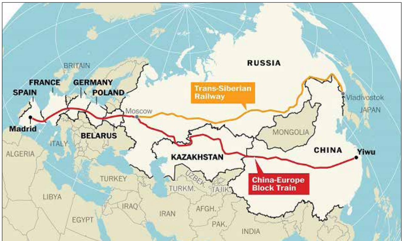
Image 4 Map Yiwu-Madrid line

km of highway from Khorgos, China, to Almaty, Kazakhstan to St. Petersburg, Russia and then Lithuania and other parts of Europe. Another railway expansion project will connect China to Kyrgyzstan and Uzbekistan. This task, with an estimated cost of US$2 billion, is fully financed by the Chinese side. The China Road and Bridge Corporation (CRBC) will be in charge of the construction while China Railway High-speed (CRH) will operate the railway. In addition, since 2012, China and Turkey have been discussing the construction of the US$35 billion rail network that would connect the Turkish eastern border city of Kars to Istanbul and via the planned Bosphorus rail tunnel, to the EU, crossing Greece and Bulgaria. The project, almost entirely financed by China, would also link the Baku-Tbilisi-Kars rail route enabling connections to Azerbaijan and Georgia. Transport and logistics integration are also expected to benefit from the planned rail link project that will connect Urumqi, Chinese Xinjiang Autonomous Region with Ashgabat, Turkmenistan and then run from the Turkmen capital to the Iranian border.