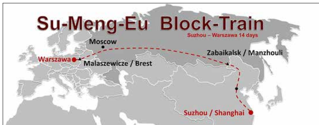
Image 3 Map Suzhou-Warsaw line

So far, there is no EU approach in shaping the land connection. While Germany has been a focal hub for the beginning of the overall project, Poland, Czech Republic and soon Netherlands and Belgium are likely to increase their presence in the rail network. From the financial side, the Chinese authorities are willing to invest in promoting the rail network with the EU but apart from the rhetoric in their public announcements, there has not been any improvement in the establishment of structured government communication channels. Much rests on a case-by-case approach as seen in the MOFCOM's willingness to pursue bilateral discussions with Germany and Poland. Also with the enhanced cooperation between China and the CEE countries under the "16+1" framework, there are plans for new routes, including linking the rail network with the Greek logistic hub/port at Piraeus and the new Chinese investment areas in Bulgaria. Speculation is that China is already promoting