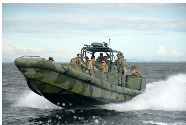
Courtesy of Flickr account of U.S. Pacific Fleet and used under a creative commons license.