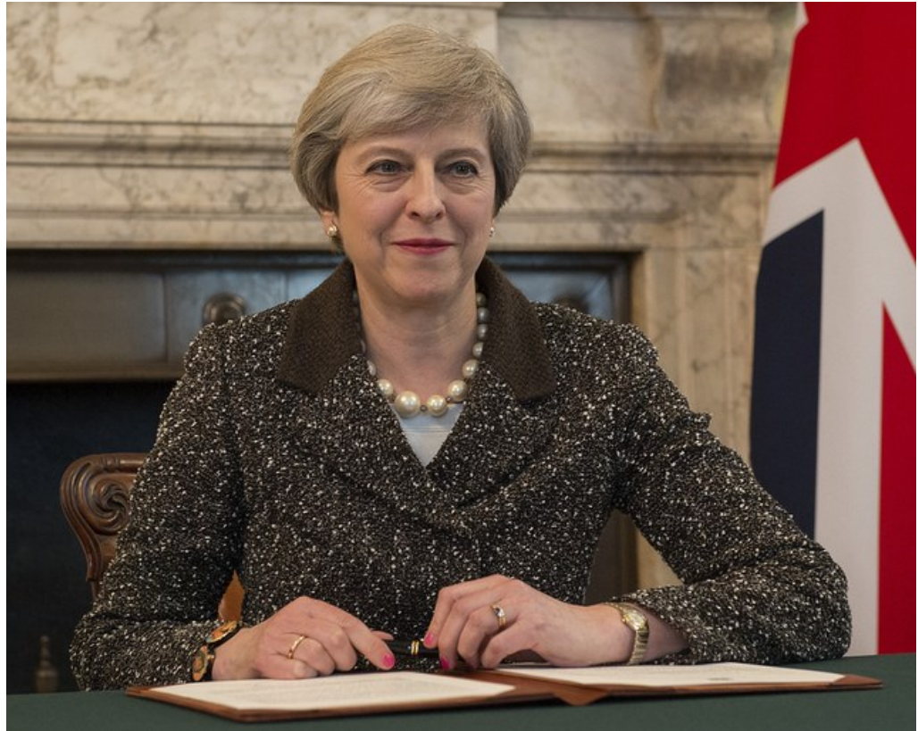
PM Signs Article 50 Letter