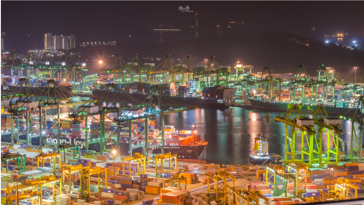
Singaporean Port, High Traffic

This week, the UK government will finally start the process for Britain's withdrawal from the EU. The rest of the world is assessing how exposed other countries are to the almost inevitable economic fallout that will follow Brexit. How will ASEAN be affected, given the region's globally-connected export content?