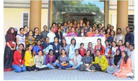
Loyola College, Chennai, and other colleges in Coimbatore and Kochi.

The project is a first-ever unique and innovative pan-India initiative on developing templates for Gender Audits in college and university campuses across India. The workshop built an engaged cohort of senior management, faculty and students who are committed to collaboratively making their campus gender-just and inclusive by raising awareness, tracking progress on the many parameters of gender equity and justice on campus, and maximizing the reach of gender-sensitization processes. Eminent gender experts and educators from the US and across India facilitated the participatory workshop, with participation drawn from