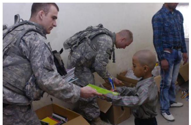
Courtesy of Flickr account of US Army and used under a creative commons license.

Brecht De Vleeschauwer, The New Humanitarian 24 April 2019