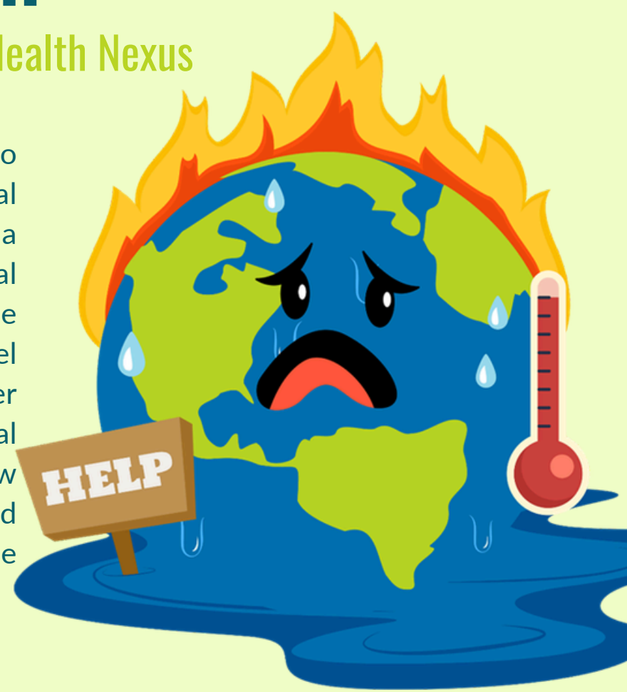
FIGURE 1: CASCADING RISKS: ANTHROPOGENIC DRIVERS AND PLANETARY HEALTH OUTCOMES IN SOUTHEAST ASIA

As ASEAN operationalises Vision 2045, the most pervasive threats to regional stability stem from the systemic disruption of our natural ecosystems. Addressing these compounding crises requires a shift to a Planetary Health paradigm, a structural approach to Non-Traditional Security (NTS) which recognises that human health and economic resilience are inextricably bound to ecological stability. When macro-level anthropogenic activities breach environmental boundaries, they trigger cascading crises that transcend borders and overwhelm national social protection systems. To illustrate this, this NTS Fast Fact illustrates how upstream environmental degradation drives direct health security risks, and how the escalating climate stressors disproportionately compound the vulnerabilities of ASEAN's rapidly ageing demographic.