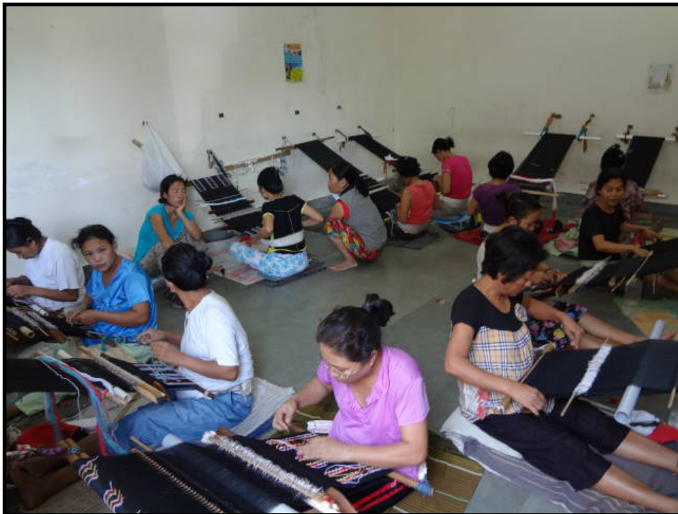
Figure 3: Women refugees at work at the Don Bosco production centre.

Although the self-sufficiency of refugees through employment is a key goal, there are many obstacles hampering their efforts. Employers hesitate to hire illegal workers and women are pushed into the informal labour market where they work in low-skilled and low-paying jobs, at factories and restaurants, and as cleaners and domestic helpers. 32 Others are self-employed, stitching traditional clothes and bags or undertaking small-scale catering services. Some have found employment under the Koshish enterprise at the Don Bosco production centre in Vikaspuri where they are trained in weaving and sewing. Women refugees mention various problems at the workplace including language barriers, exploitative working conditions, inequality in wages, and assault.