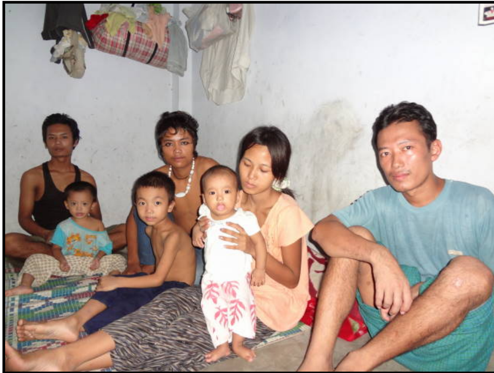
Figure 4: Many Burmese refugees live in urban villages, often sharing rooms with extended family members. A family of seven in their one-room abode is pictured here. Photograph taken on 15 September 2011.