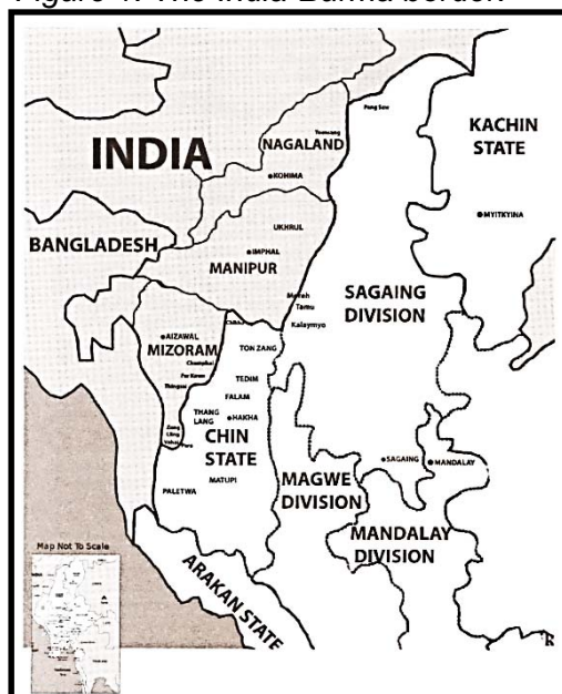
Figure 1: The India-Burma border.

Source: The Other Media, Battling to survive: A study of refugees and Burmese asylum seekers in Delhi (New Delhi: The Other Media, 2010), 17.